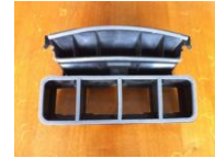
Cutting of Felt and Foam parts for sealing areas in heating systems etc.