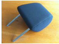
Cut and sewn head rest cover