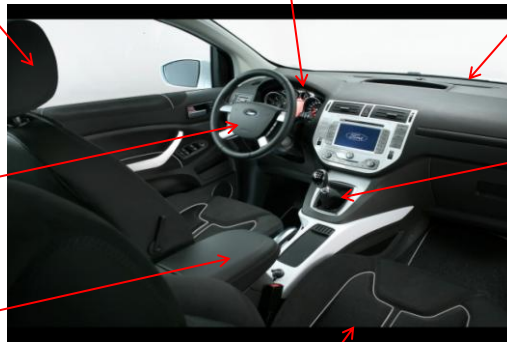
Materials and components for airbags