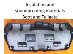
Insulation and soundproofing materials Boot and Tailgate