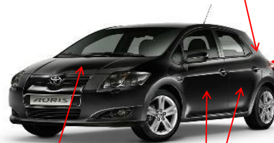
Insulation and soundproofing materials for under bonnet